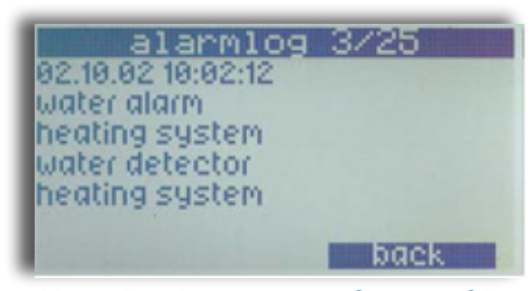
Alarm log, log entry no. 3 out of 25